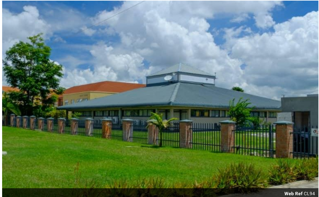
Web Ref CL94

403A Lilayi Road, Lilayi, Lusaka, Zambia