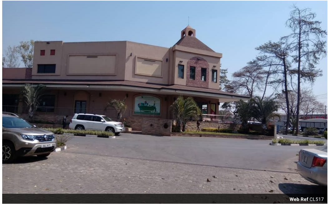
Web Ref CL517

403A Lilayi Road, Lilayi, Lusaka, Zambia