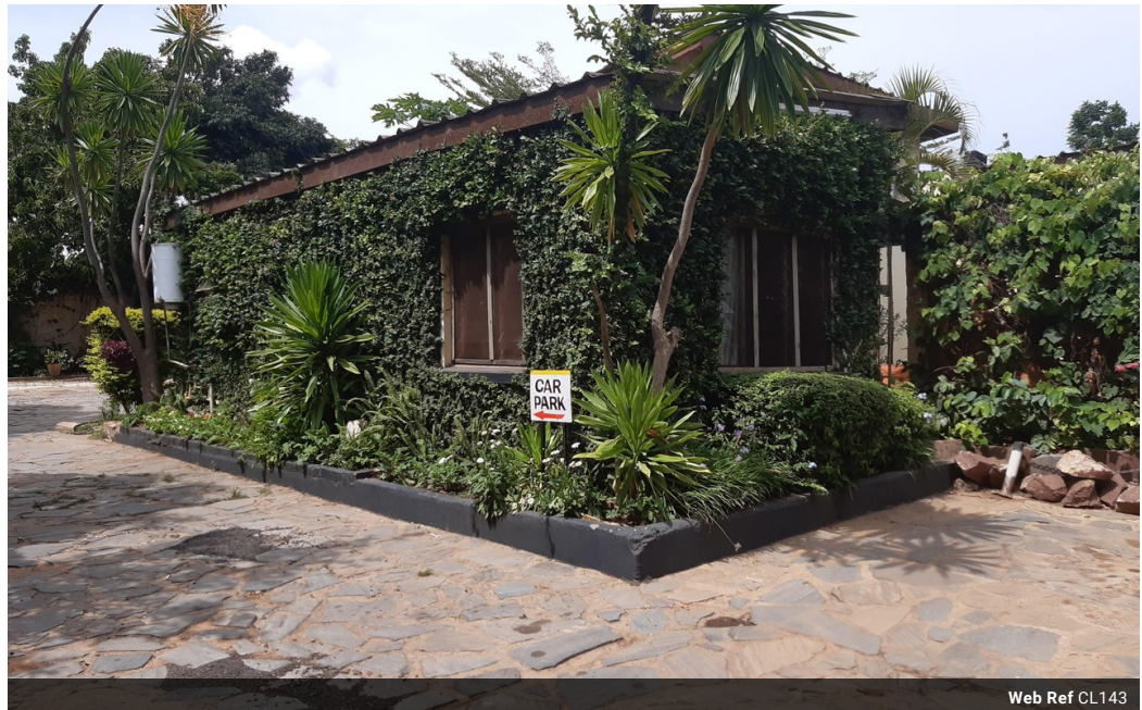
Web Ref CL143

403A Lilayi Road, Lilayi, Lusaka, Zambia