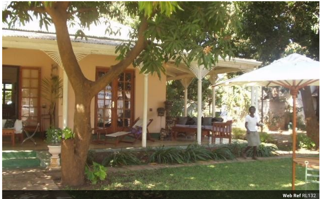
Web Ref RL132

403A Lilayi Road, Lilayi, Lusaka, Zambia