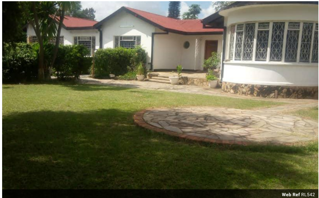
Web Ref RL542

403A Lilayi Road, Lilayi, Lusaka, Zambia