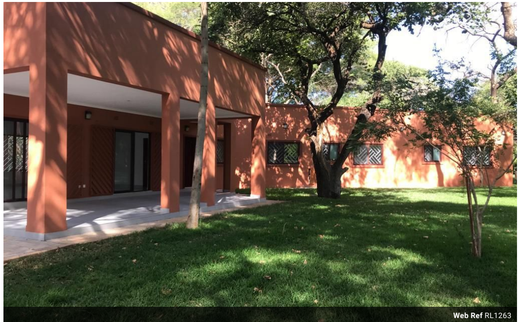
Web Ref RL1263

403A Lilayi Road, Lilayi, Lusaka, Zambia