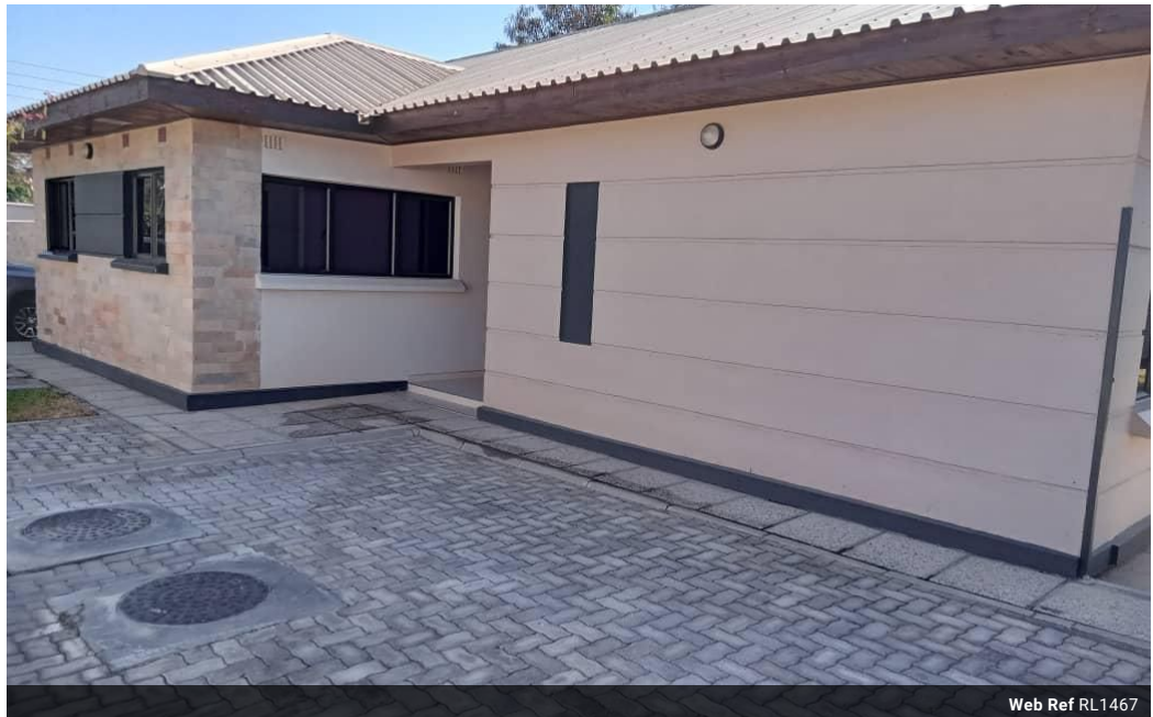
Web Ref RL1467

403A Lilayi Road, Lilayi, Lusaka, Zambia