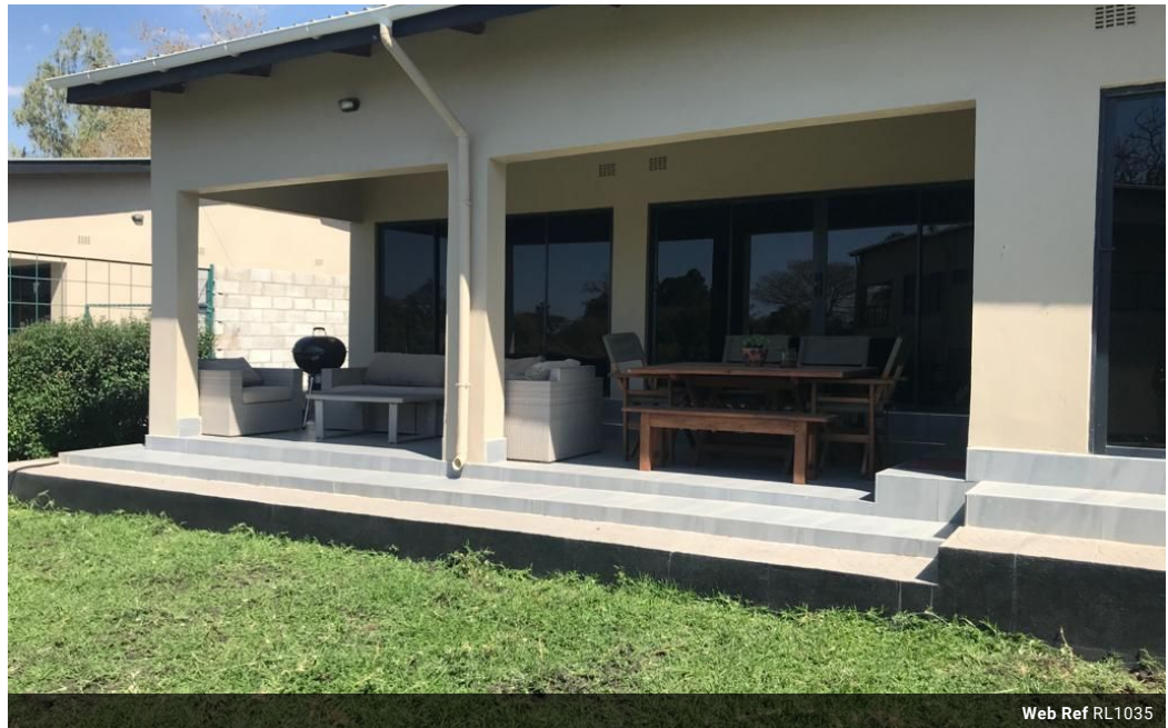
Web Ref RL1035

403A Lilayi Road, Lilayi, Lusaka, Zambia