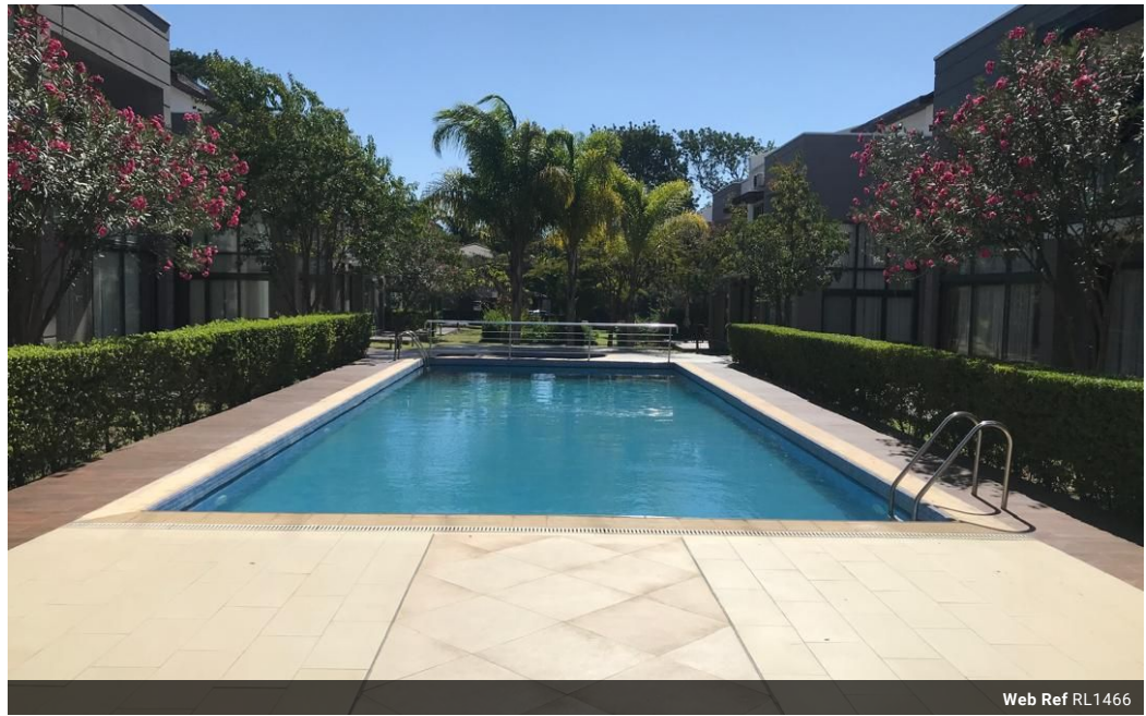
Web Ref RL1466

403A Lilayi Road, Lilayi, Lusaka, Zambia