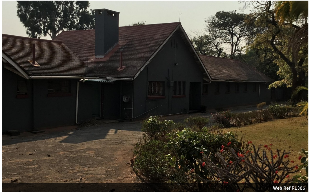
Web Ref RL386

403A Lilayi Road, Lilayi, Lusaka, Zambia