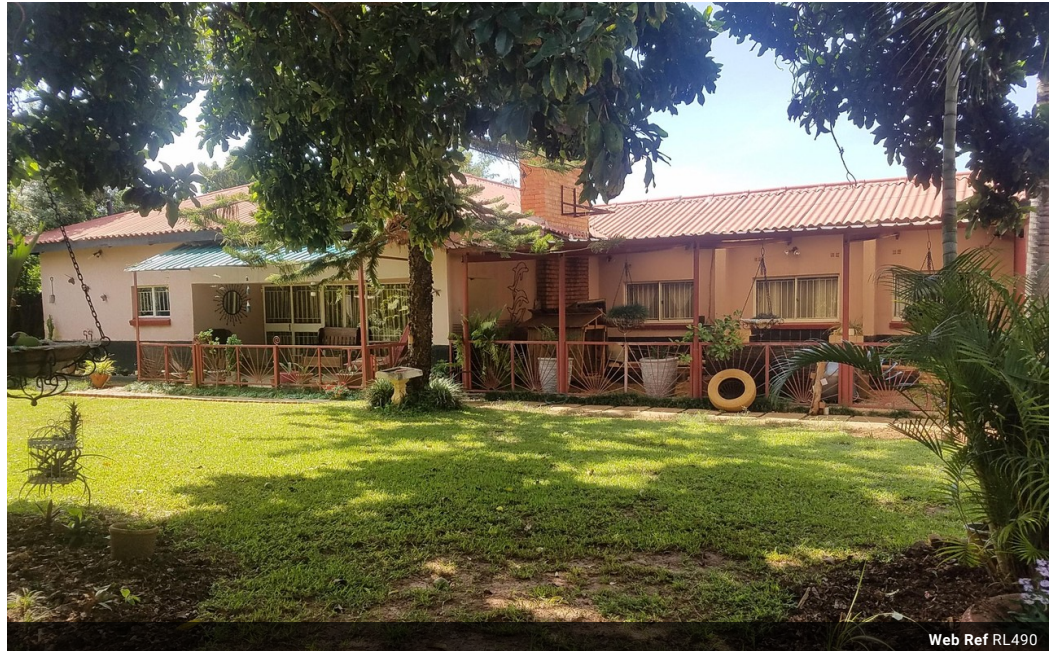
Web Ref RL490

403A Lilayi Road, Lilayi, Lusaka, Zambia